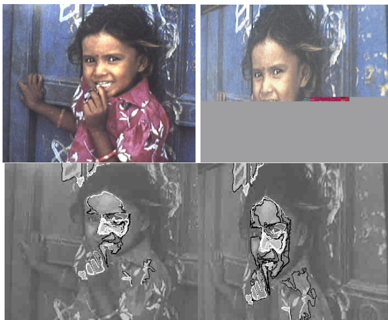
FIGURE 3. Experiment 3. Blind shape definition in a pair of images with a strong projective deformation. Both images have been taken by a camera with different illumination and pose. First row, original images. Second row, corresponding shapes between the images.

and also are self-similar, up to a circular permutation of the vertices. The second row shows that this self-similarity is detected.